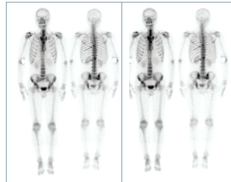
Single Head 30 min*, Ant then Post Standard

Dual Head Performance Package (DHP) enables you to cut acquisition time to rival a dual-head system in many common procedures